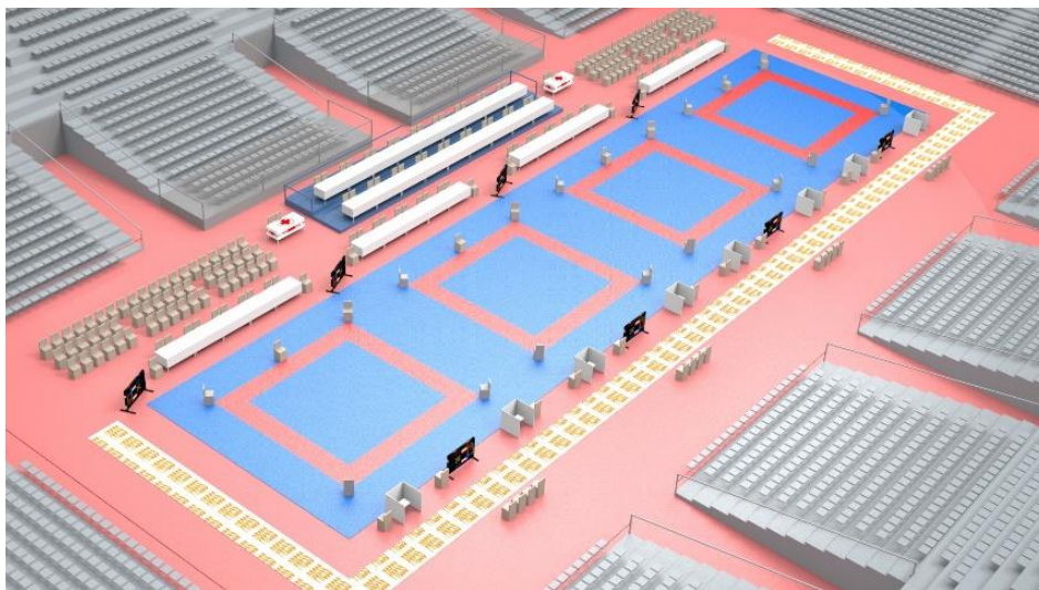
Illustration g 2: Layout during the eliminations

6.300 persons can join live the Anton Bruckner Privatuniversität and Partner´s opening concert (illustration 1).